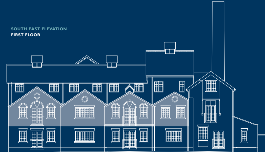
SOUTH EAST ELEVATION FIRST FLOOR

Apt 5: 82 sqm • 883 sq ft Apt 6: 104 sqm • 1120 sq ft Apt 7: 72 sqm • 775 sq ft