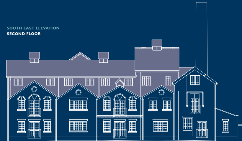
SOUTH EAST ELEVATION SECOND FLOOR